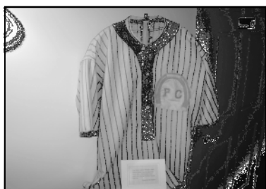
Polk City Horseshoe Lakers Baseball Uniform—1920's Worn By Virgil Swim